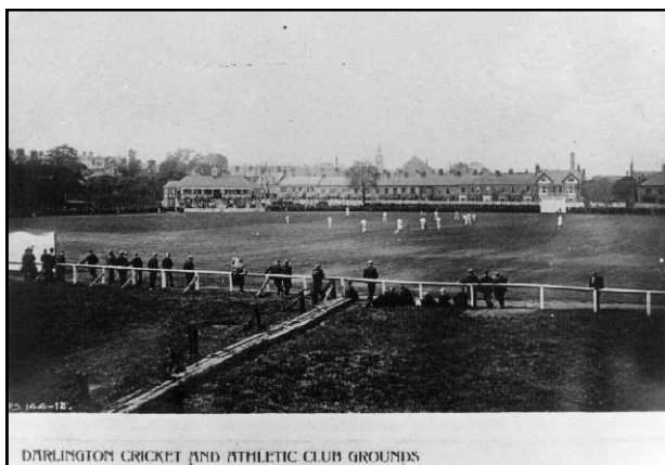
DARLINGTON CRICKET AND ATHLETIC CLUB GROUNDS