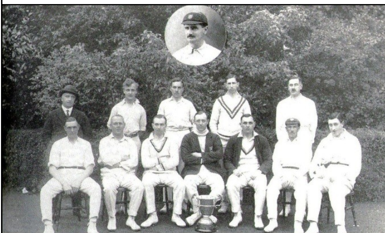
Plate 2: N.Y. & S.D. League Champions 1923.