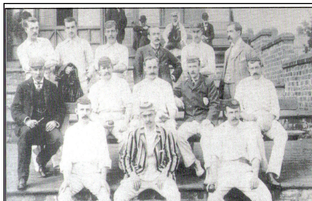
Plate 1: Durham League Champions 1893