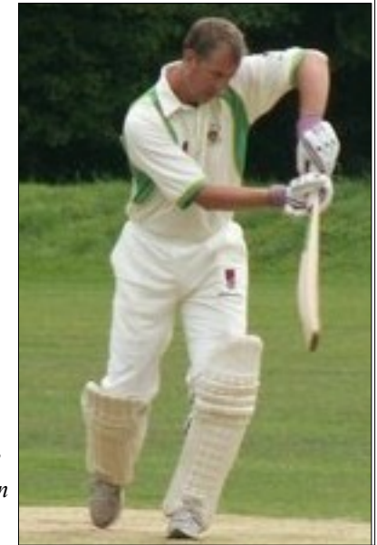
Fine 50 by Morgans not enough

The visitors polished our total off with 5.2 overs to spare, winning by 7 wickets.