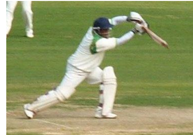
Tariq was at Billingham