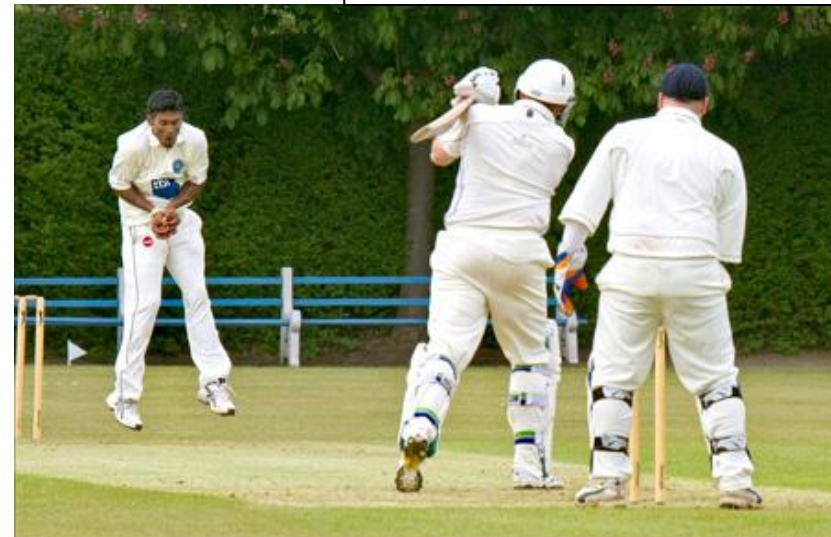
Bodisha at Hartlepool