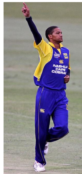
A South African at Stokeley!